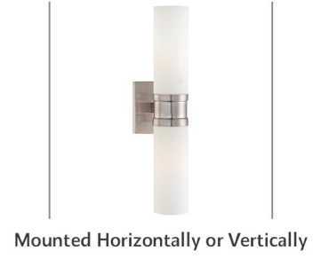
Mounted Horizontally or Vertically