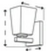
Image File Name: 4462-84.jpg