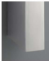
-24 Satin Nickel