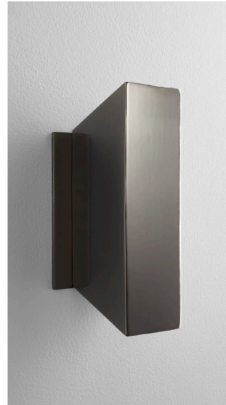
With optional backplate

LIGHT SOURCE 2 x 7W Max LED GU10 Base Socket (Lamp not included) LUMINAIRE POWER 14.4W at 120V RATED LIFE See LED bulb manufacturer specification LUMEN OUTPUT Delivered: 761 lm (LM-79)** INPUT VOLTAGE 120V DRIVER OUTPUT N/A CONSTRUCTION Plated Steel and Glass DIFFUSER - Frosted Glass FINISHES Gunmetal (-18), Satin Nickel (-24), Aged Brass (-40) MOUNTING 2" x 3" J-Box, 4" Octagonal J-Box*, 4" Square J-Box with a single device mud ring *Backplate required to cover J-Box STANDARDS UL Dry/Damp listed, ADA Compliant, Conforms to UL STD 1598, Certified CAN/CSA STD C22.2 No 250.0. **Lumen Output may vary based on the lamp that is used