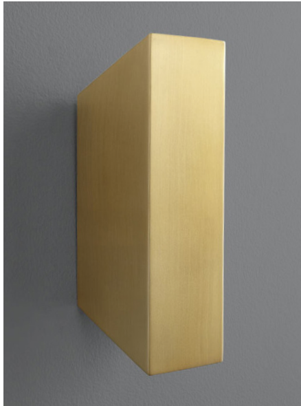
-40 Aged Brass

FIXTURE TYPE _____ LOCATION _____ PROJECT _____ DATE _____