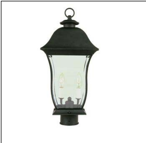
4973 BK: 2 Light Post Lantern